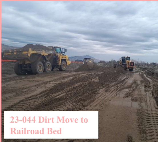
23-044 Dirt Move to Railroad Bed