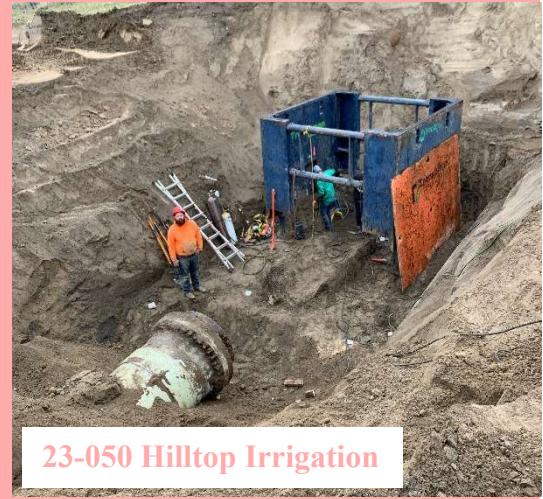
23-050 Hilltop Irrigation